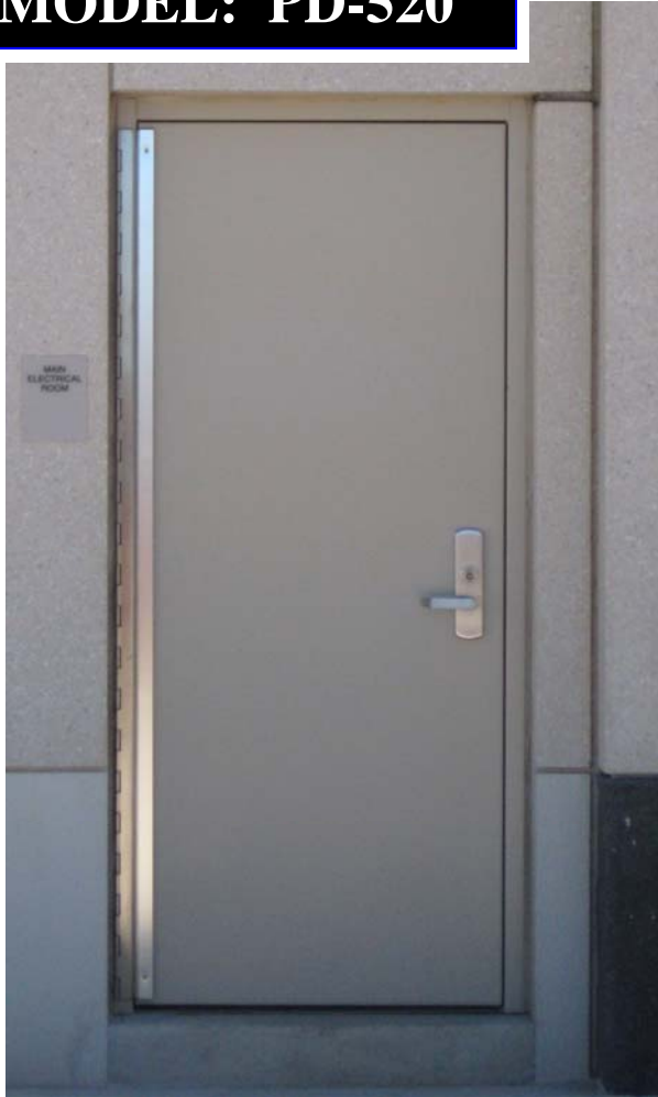
Single Swing Door with common lock and handle combination.