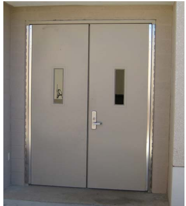
Paired Swing Door with common lock and handle combination, and windows.