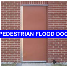
PEDESTRIAN FLOOD DOOR