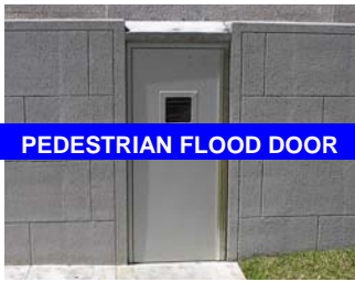
PEDESTRIAN FLOOD DOOR